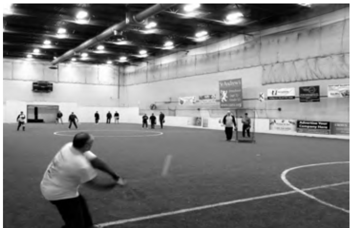
Remember....Indoor softball drills begin on Tuesday, January 2, 2018