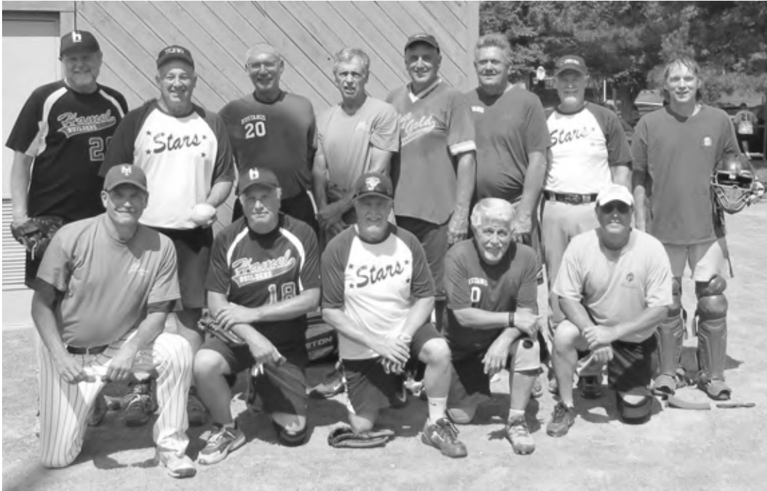
Wednesday Night 60+ All-Stars