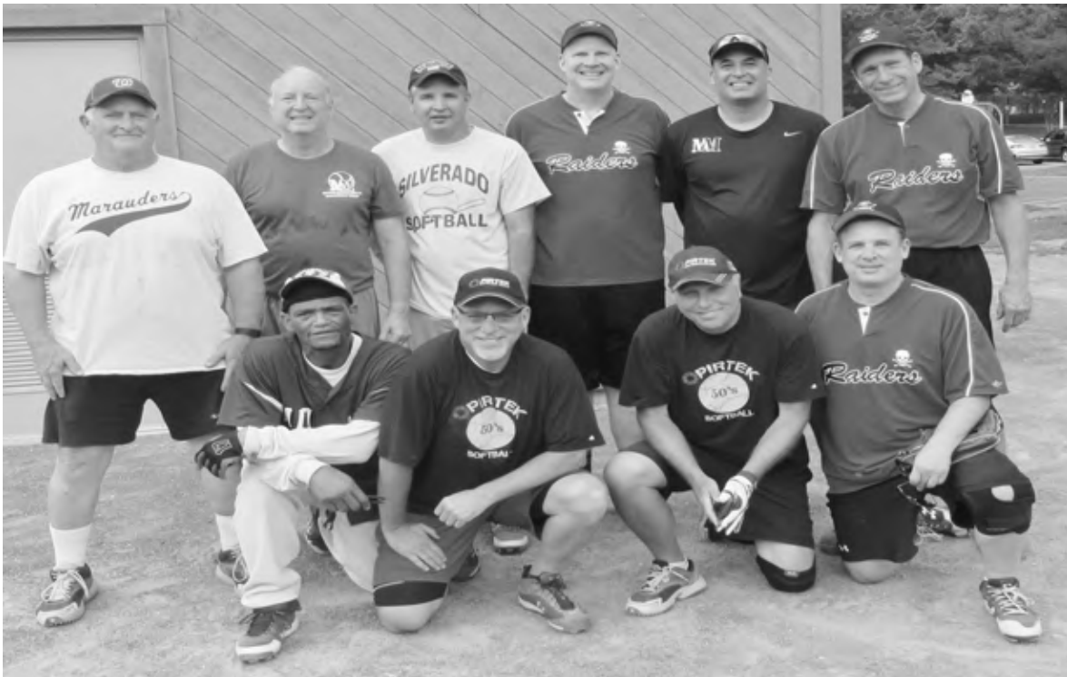
Tuesday Night 50+ All-Stars