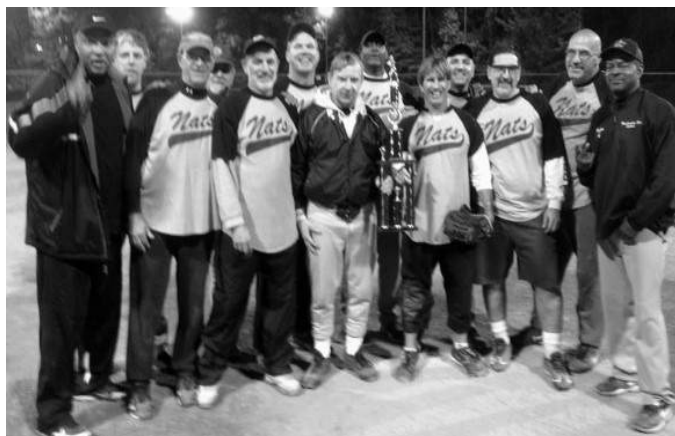
NATS, "B" Division Chanmps from 50+ Tuesday Night League