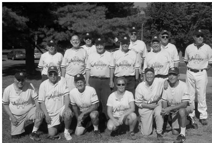
Super Senior League 2013 Spring Champions