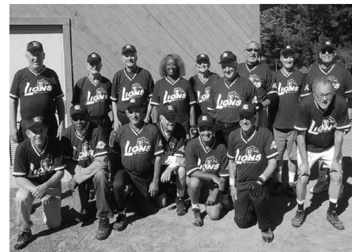
Super Senior League 2013 Fall Champions