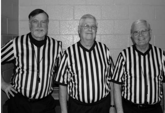
The guys who calls 'em as they sees 'em.

“The man who complains about the way the ball bounces is likely to be the one who dropped it.”